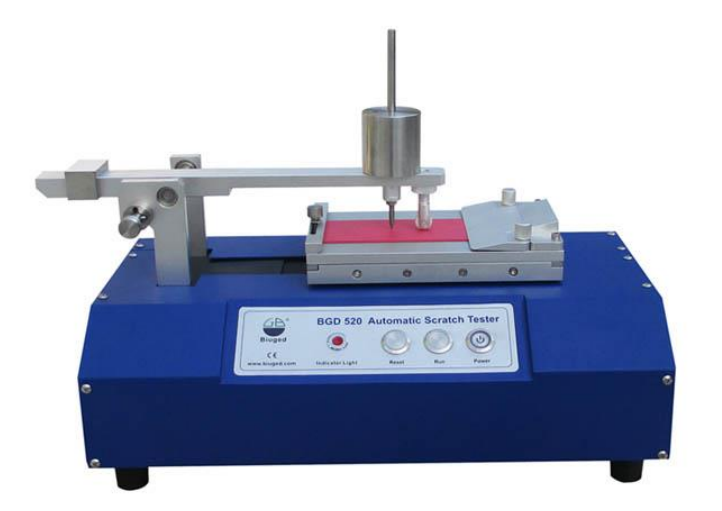
This device uses varying pressure, and measures the force required to scratch the surface.

The second technique is to apply the same pressure, but instead vary the hardness of the tip that's used to scratch the surface. For example, given the same pressure, we would expect the surface of stainless steel to be easily scratched by a tip made of diamond, but not by a tip made of copper, since copper is softer than steel's surface. This is why cutting and engraving tools commonly use carbide bits and diamond points.