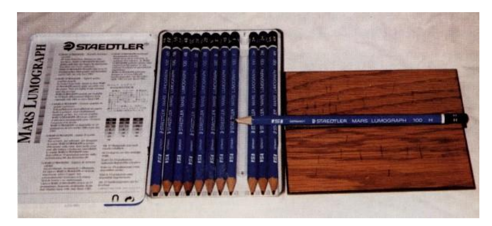
A set of calibrated test pencils intended for measuring Pencil Hardness

The pencil hardness test uses this same simple principle. While applying constant pressure, we attempt to scratch the coating surface using tips made of harder and softer materials. The point at which the hardness of the tip just matches the hardness of the coating indicates its hardness measure. In this case, the hardness of the tip is determined by the composition of the graphite among a set of pencils that range from very soft to very hard materials.