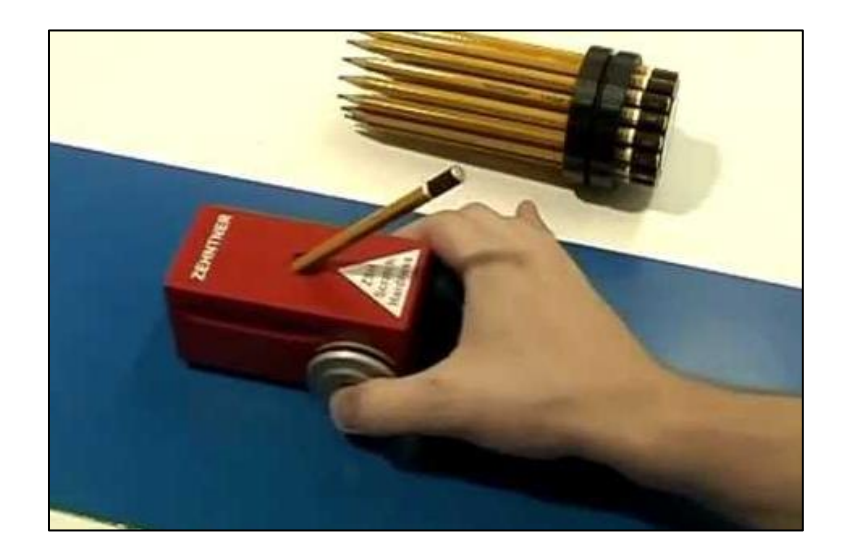
Interpretir This simple metal "car" produces more consistent test results by providing The point consistency in the angle and pressure during the Pencil Hardness test procedure ratch the surface is the reported surface harness level.